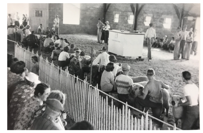
1948 Market Lamb Show

The 1945 Pickaway County Fair featured an amateur horse show, amateur races for junior pony, bicycle and scooter enthusiasts. Exhibits included beef and milk cattle, poultry, sheep, swine, farm produce, farm equipment, needlework, canning, and preserving.